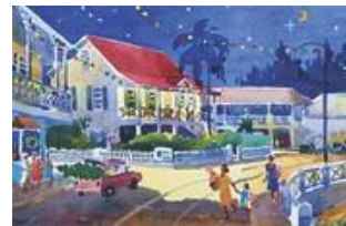
Image: Joanne Sibley (NDA), Christmas Time on North Church Street , private collection

• Choose one detail of Fishermen and try to recreate this—it could be a person, the dogs or a boat on the water. Try to match the colour, light and shadowing seen in Sibley's.