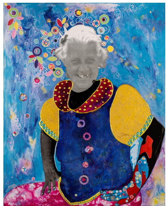
Carnival Duppy IV: Alice in Wonderland , from the Carnival Duppy Series, 2007-2022.

On the next page, draw your own portrait of an inspiring woman. She could be a parent, grandparent, guardian, neighbour, teacher, friend, cousin, or even a celebrity you admire!