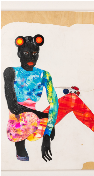
These Cotta Girls Won't Be Colonized IX (detail), 2021.