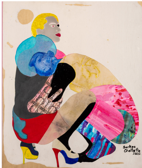
Where is Womanhood? , 2022.